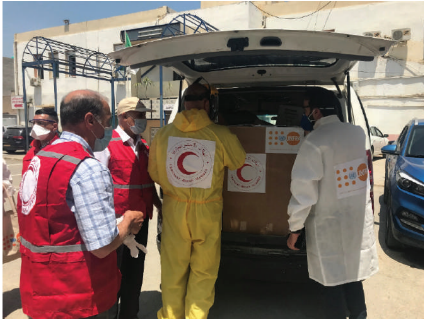
Figure 2: Distribution of PPE testing kits by the Algerian Red Crescent, provided by UNFPA.