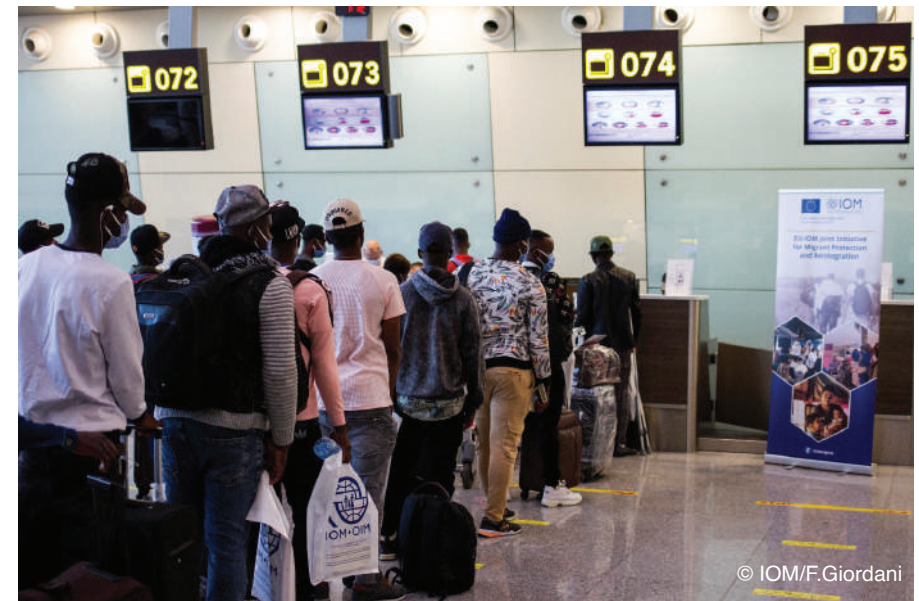
Figure 4: Voluntary return of migrants to Guinea, Ivory Coast and Liberia organized by IOM in collaboration with the Algerian government and the countries of origin

Two special flights for voluntary returns of migrants stranded in Algeria have been organized, on 14 July and 31 August respectively. The first flight benefitted 84 migrants originating from Mali and the second one 114 individuals originating from Guinea, Ivory Coast and Liberia. The special flights were organized in close collaboration with the Algerian government and the governments of the countries of origin and have permitted migrants, including unaccompanied children and alone women with children to reunite with their families.