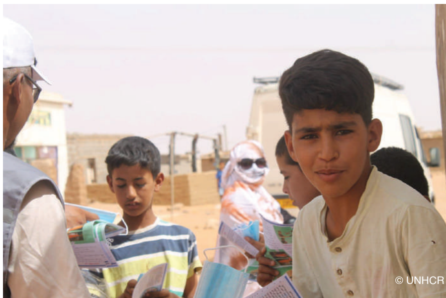
Figure 5: Awareness raising for the use of facemasks and the application of physical distancing measures in the refugee camps in the Tindouf province