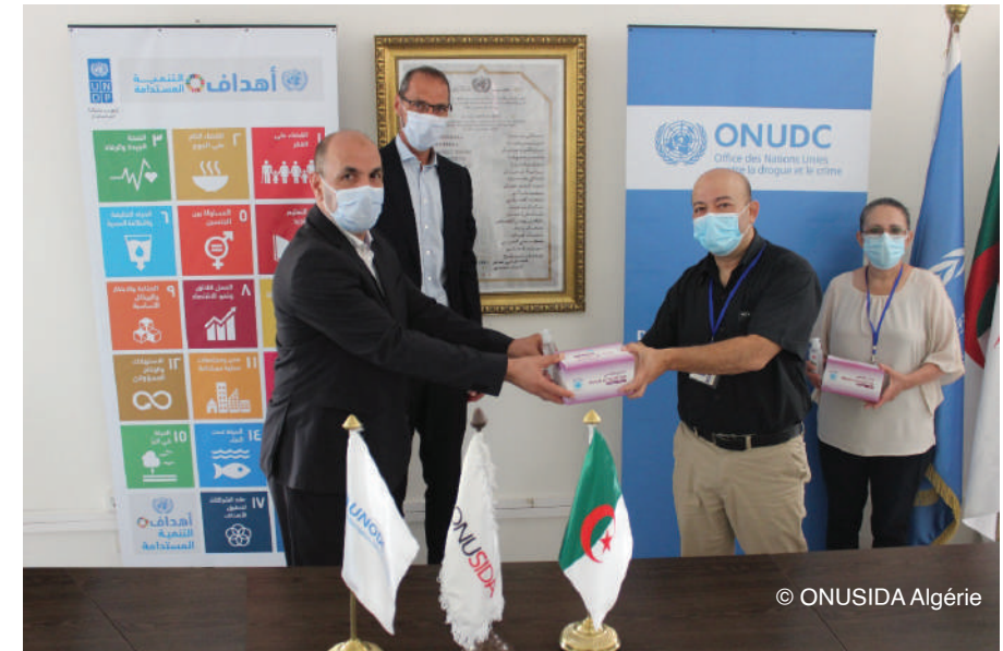
Figure 3: Delivery of Covid-19 protective equipment to NGOs

UNAIDS has coordinated with UNODC in support of the Ministry of Health and NGOs with a view to provide protective and communication equipment to ensure the continuation of HIV prevention services destined at injection drug users.